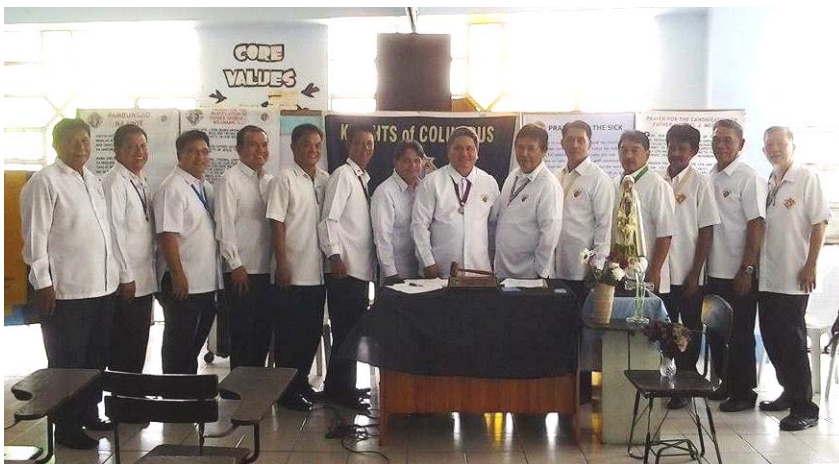
The GOLDEN OFFICERS