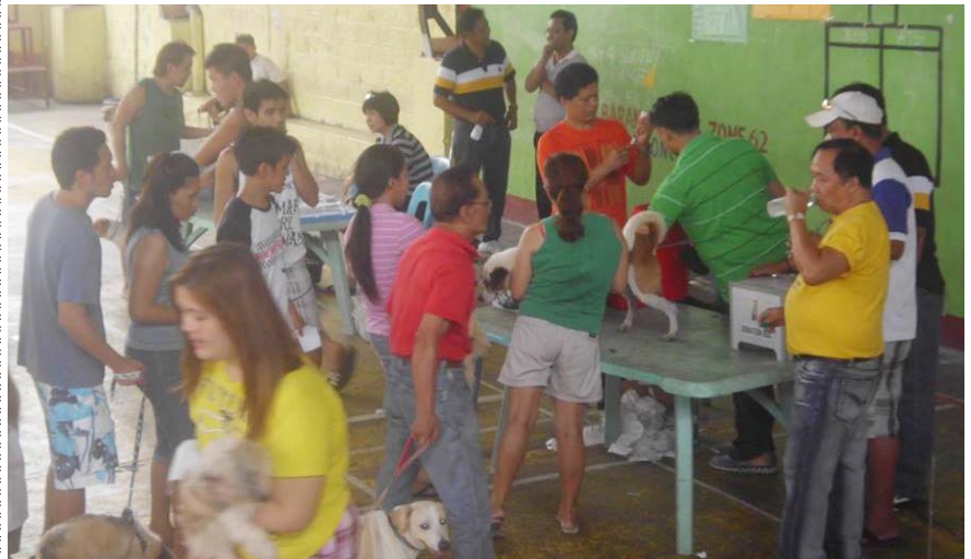
ANTI-RABIES VACCINATION – Every year, Our Lady of Fatima Council 5579 holds an anti-rabies vaccination, in cooperation with the Society for the Prevention of Cruelty to Animals. This year, more than 300 dogs were vaccinated. Photo shows some dog owners holding their pets, while some dogs are being vaccinated.