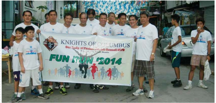
FUN RUN 2014 – Council 5579 participated in the Fun Run 2014 during the Parish Fiesta. In photo are some of the K of C participants with two children who joined the event.